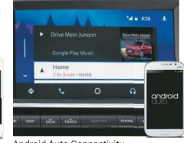
Android Auto Connectivity