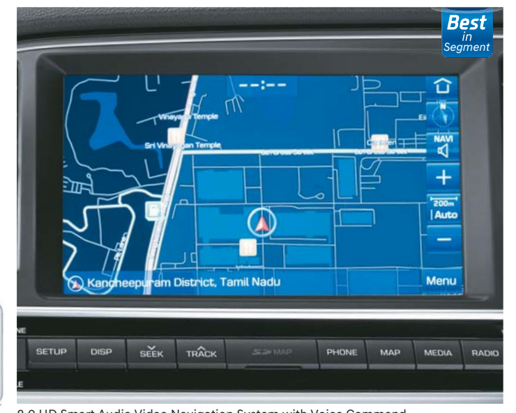
8.0 HD Smart Audio Video Navigation System with Voice Command