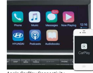
Apple CarPlay Connectivity