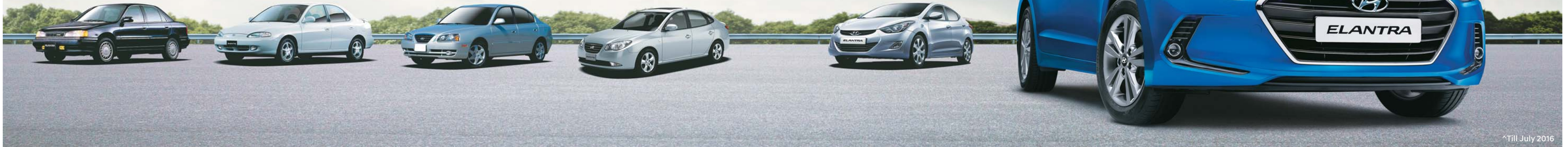
6 th Generation 2016