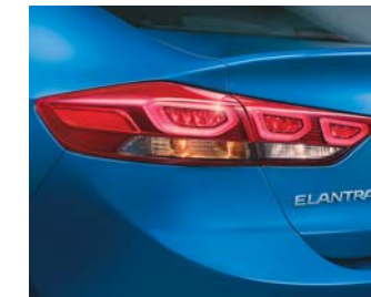
LED Rear Combination Lamps

Globally Acclaimed Fluidic Sculpture 2.0 Design | Shark Fin Antenna Chrome Finish Beltline | R16 Gun Metal Finish Alloys | Outside Mirror Welcome Function