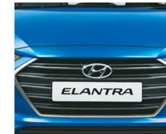
3 Dimensional Radiator Grille