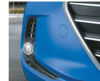
Projector Fog Lamp