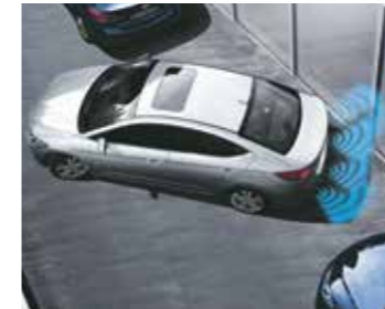
Rear Camera with 4 Parking Sensors