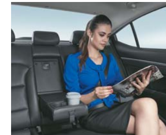
Rear Seat Armrest with Cup Holders