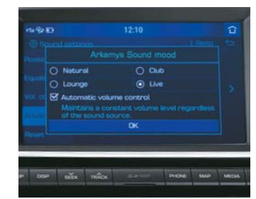
Arkamys Sound Mood