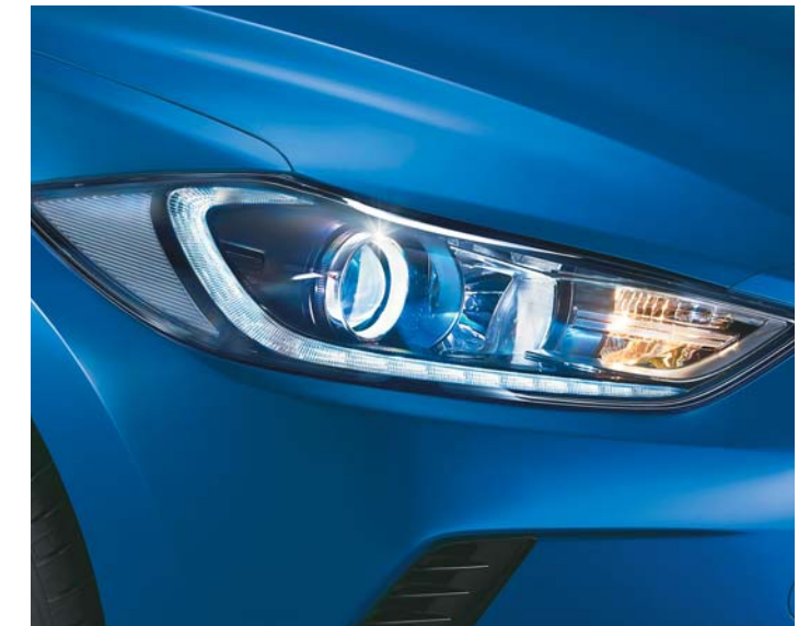
HID Headlamps with LED DRL