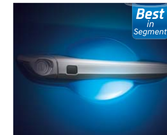
Chrome Door Handle with Pocket Light