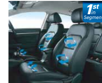
Front Seat Ventilation System