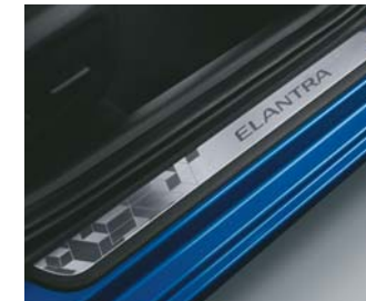
Premium Aluminium Scuff Plates