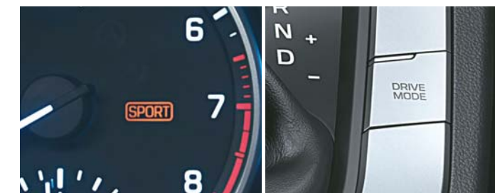
Drive Mode Select: Eco & Sport Mode