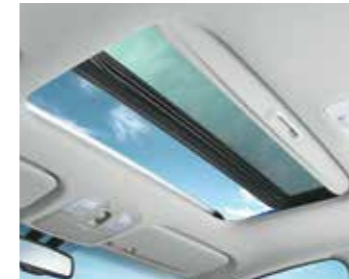
Smart Electric Sunroof