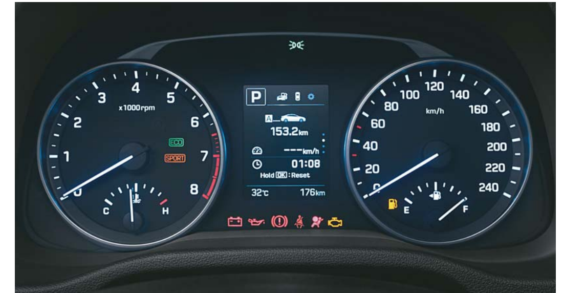
Advanced Supervision Cluster with Large 3.5 mono TFT Screen

Discover a world of affluence with the all new Elantra. Get overwhelmed with its plush interiors and arrive in style wherever you go.