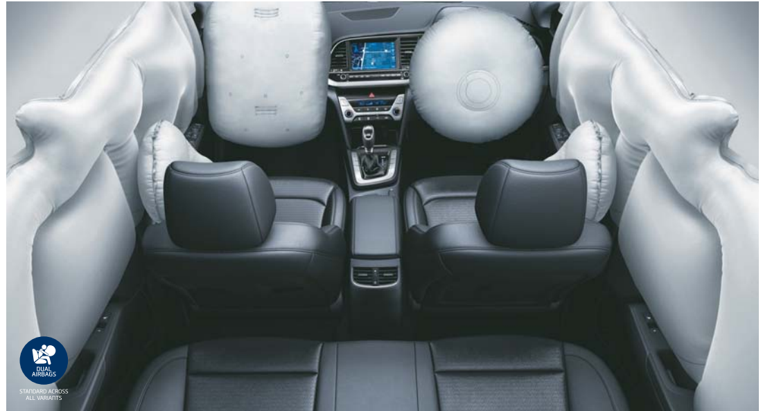
Six Airbags (Driver, Passenger, Side & Curtain)

The all new Elantra is designed with a top-of-the-line active and passive safety features that ensure complete passenger safety in all conditions.