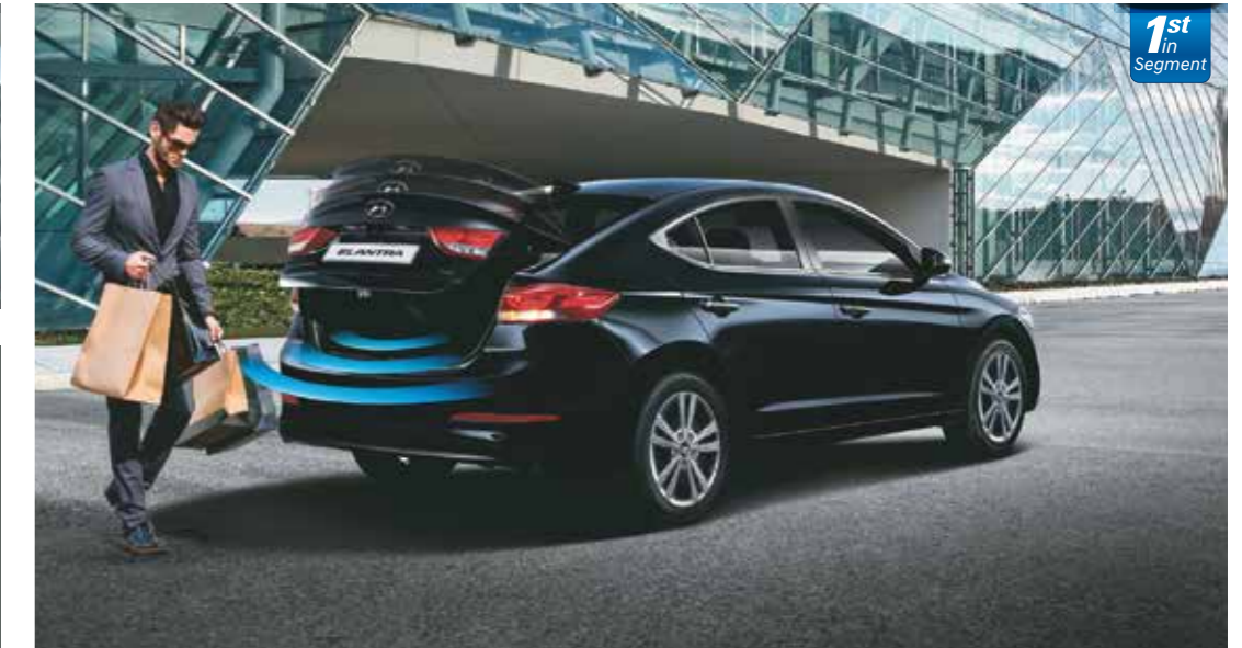
Hands Free Smart Trunk

Discover innovation like never before. The all new Elantra comes with class-leading features, thoughtfully crafted to offer an effortless driving experience.