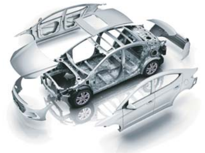
Strong Structure with 53% Advanced High Strength Steel