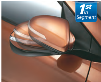
Auto-foldable Electric Mirrors with Welcome Function