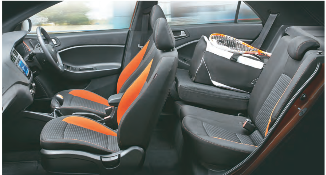
60:40 Split Rear Seat

Comfort is what makes every drive a pleasure. That's why, every inch of the i20 Active spells comfort and convenience. There are many features and specifications that are exclusively designed for those who like to do things effortlessly.