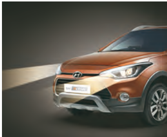
Headlamp Escort Function