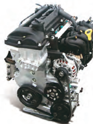
1.2L Kappa Dual VTVT Petrol Engine