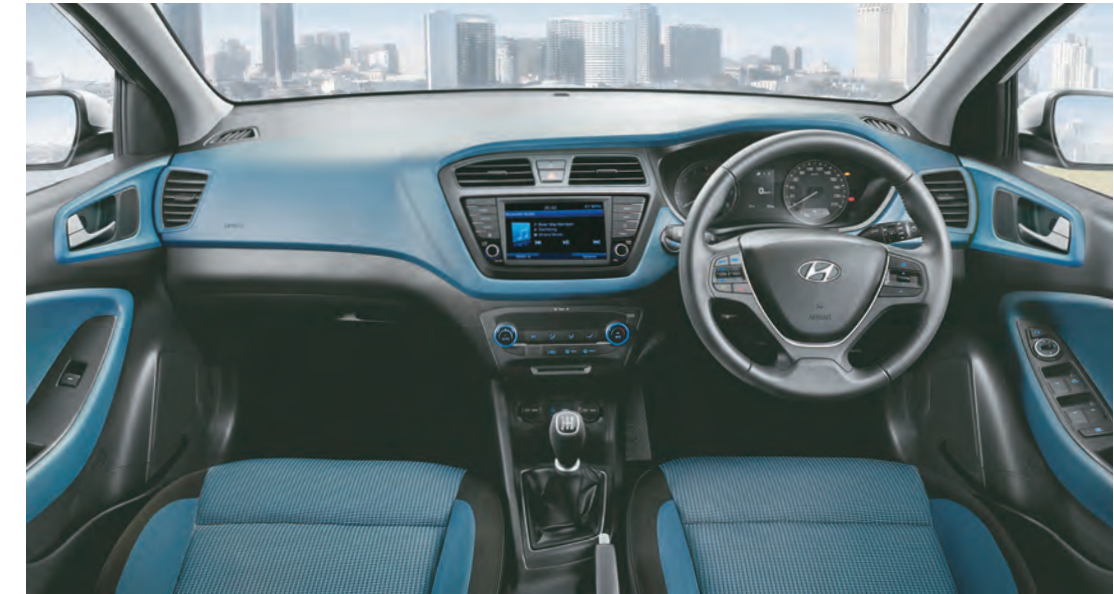
Two Tone Interior Key Colour

The spunky and stylish i20 Active is thoughtfully designed with vibrant interiors (with the options of Tangerine Orange and Aqua Blue) and ample space. The 1st in segment 7.0 Audio Video Navigation System comes with smartphone connectivity (Apple CarPlay, Android Auto and Mirror Link).