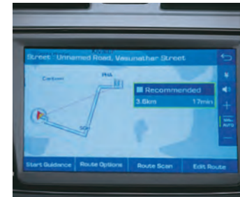
3D Map View