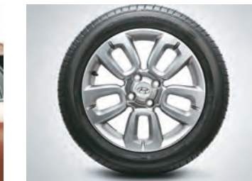
R16 Diamond Cut Alloy Wheels