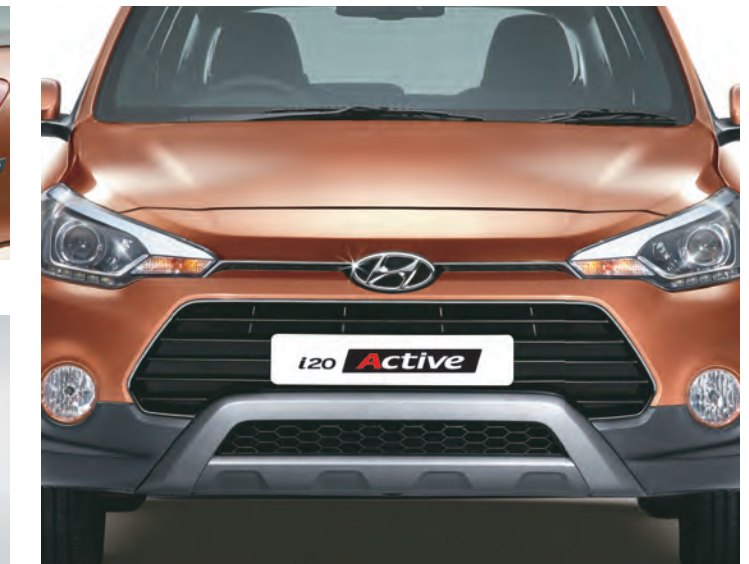
Front Air Dam with Two Tone Bumper and Silver Finish Skid Plates