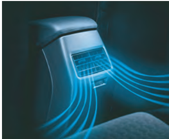
Rear AC Vents