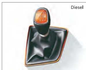
6-speed Manual Transmission