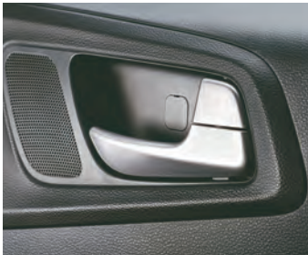
Impact Sensing Door Unlock & Speed Sensing Auto Door Lock