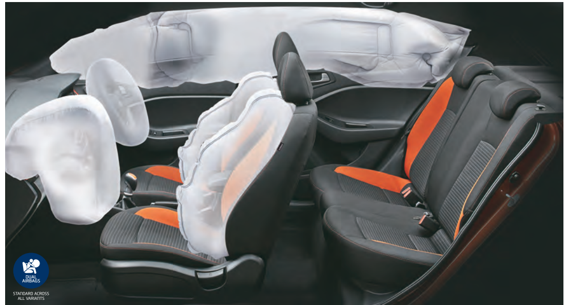
Six Airbags (Front, Side & Curtain)

The i20 Active has safety measures that always make you feel at ease. So whether you're chilling with your friends in the car or out on a trip, feel safe and enjoy the drive.