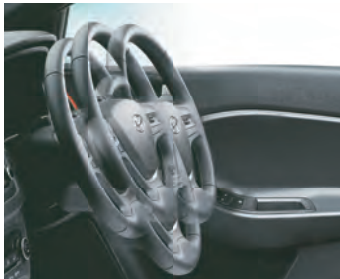
Tilt and Telescopic Steering