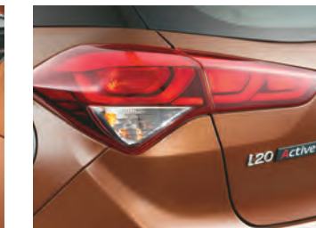
Unique Designed Tail Lamps