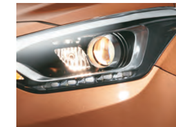
Projector Headlamps with LED DRL, Positioning and Cornering Lamps