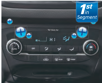
FATC with Cluster Ioniser