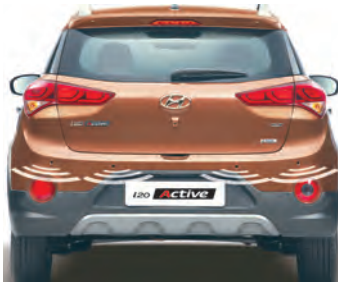
Reverse Parking Sensors with Camera