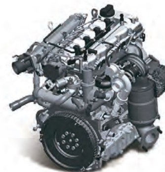
1.4L 2nd Gen U2 CRDi Diesel Engine